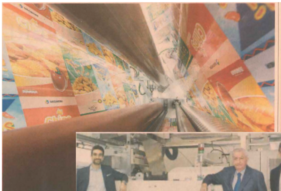
Photo: plastic films for food packaging produced by Nordmeccanica.

"We will distribute the fuel cards to employees by the end of October"